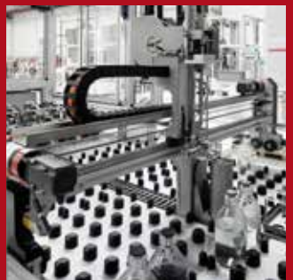
Double robotic arms