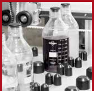
Dye solution storage